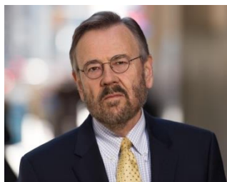
Hon. Garth Turner PC

Senior Vice President, Private Client Group, Financial Advisor